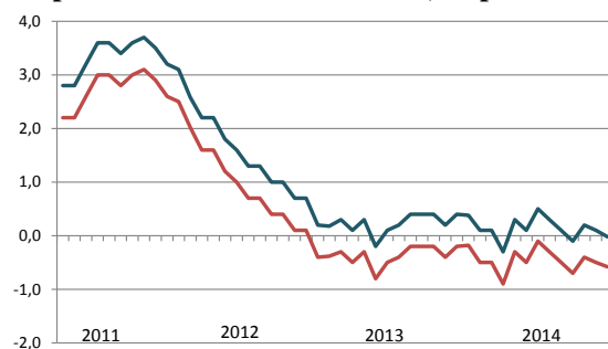
Graph 2: Monthly development of the inflation rate 2011-2014, 95 percent confidence interval