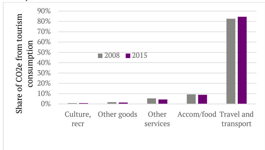
Figure 3.2 Share of greenhouse gas emissions from tourism consumption, by product group, 2008 and 2015, indirect and direct emissions