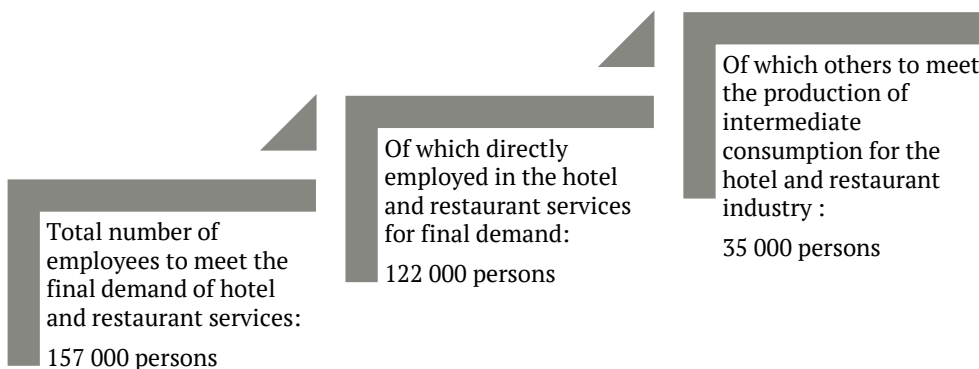
Figure 2.2 Example of employed persons in hotel and restaurant services with the IOA – from the final use side